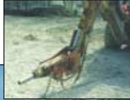
MOUNTED BREAKER ON BACKHOE