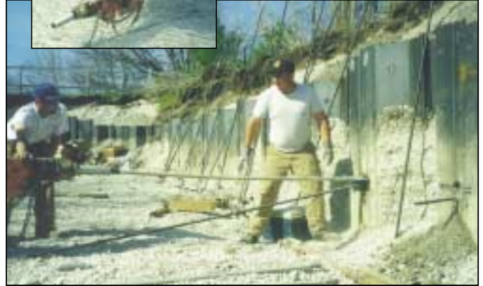
MOUNTED BREAKER ON BACKHOE