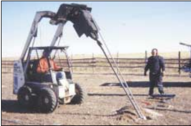
MOUNTED BREAKER ON SKID STEER LOADER