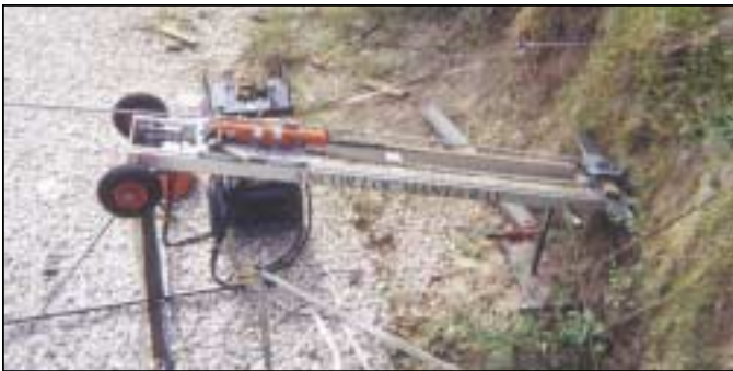
MANTA RAY DRIVE MAST