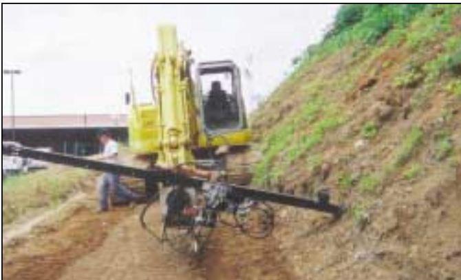
ANCHOR DRIVER MACHINE ON EXCAVATOR