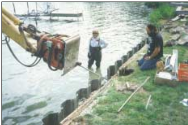
VIBRATORY PLATE COMPACTOR