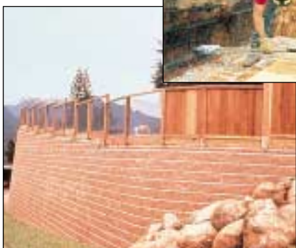
ALLAN BLOCK RETAINING WALLS

Rather than conventional timber deadmen, MANTA RAY anchors are used to provide proof loaded tie backs to insure permanent structural integrity with minimal excavation.